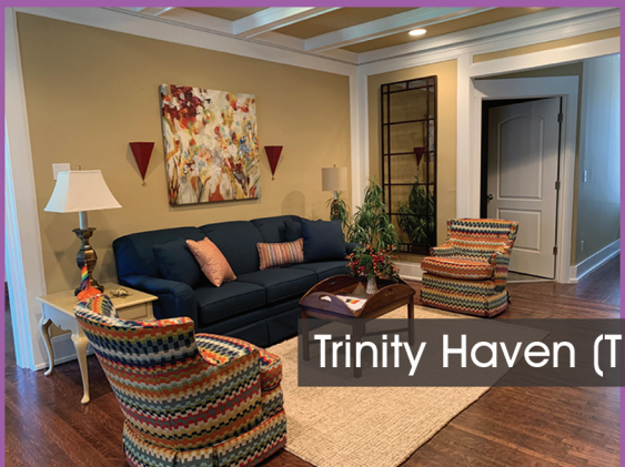
Trinity Haven (TLP) Living Room & Double Bedroom